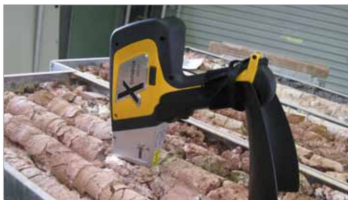
DELTA for core samples