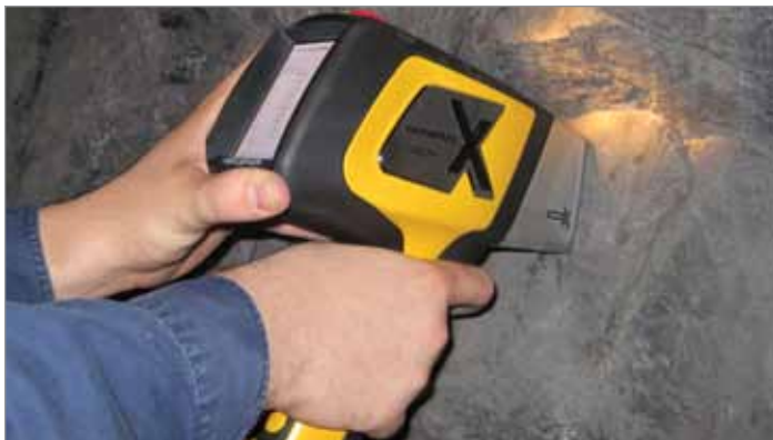
DELTA for grade control