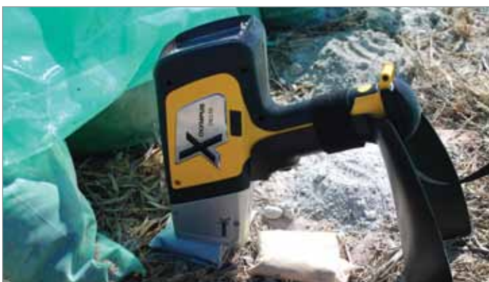
DELTA for bagged samples