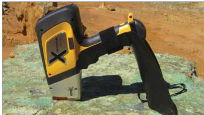
DELTA in Soil Foot