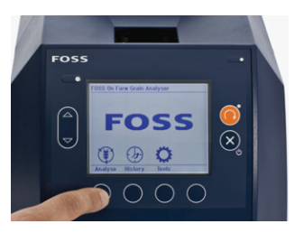
2. Select grain type